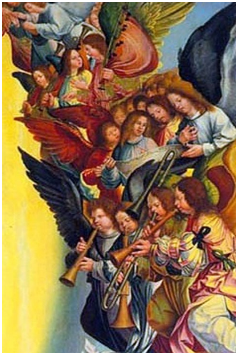
Figure 1a: Detail of angel musicians from Mestre de 1515. Shawm band plays (likely a motet) alongside singers. Trumpet ensemble depicted not playing.

appears to have inflated cheeks, with a centred embouchure. This may represent the artist attempting to depict the action of blowing or may be indicative of a rudimentary stage of the blowing technique. Some of the first brass specialists writing on the subject of embouchure, including Bendinelli in 1614 and Altemburg in 1795, considered this aspect of playing technique a bad practice and one that should be abandoned (Wallace and McGrattan, 2012, pp.57–58; Tarr, 1988, pp.85–86).