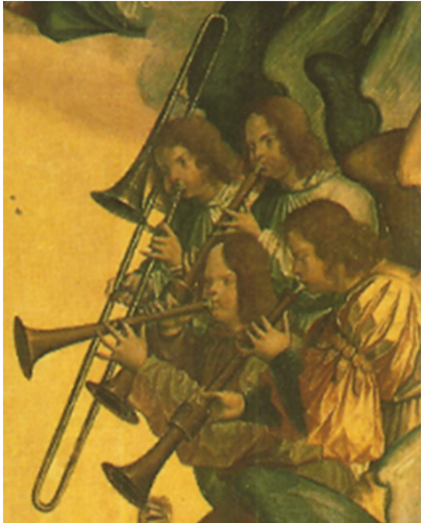
Figure 4a: Detail of a shawm band from the Oficina de Lisboa (attributed).