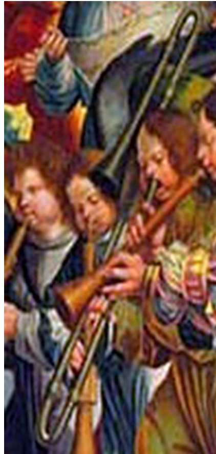
Figure 1b: Detail of trombone player's handgrip from the Mestre de 1515. Design details featured: Slide bow and ferrules of trombone and hexagonal barrilete of bombard. Detail of bell's ferrules and missing stays (both the bell and slide stays). Technical elements: inflated cheeks and embouchure; details of underhand grip of trombone player's right hand.