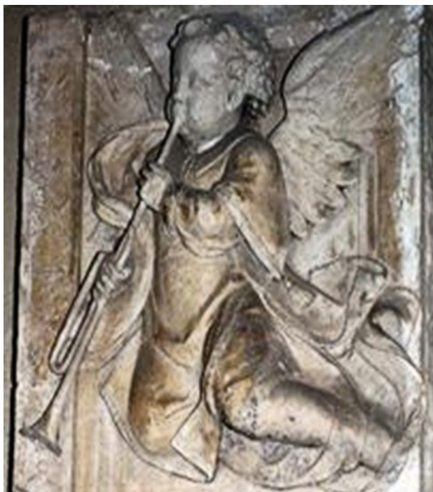
Figure 9: Detail of an angel musician playing what appears to be a single-slide trumpet from Jean de Rouen (João de Ruão), Music Angels (Anjos Músicos), 1535, Museu Nacional Machado de Castro, E97, Coimbra.

dated 1535 17 , and a Flemish tapestry from the Workshop of Bartholomeus Adriaensz in Brussels, completed between 1555 and 1560.