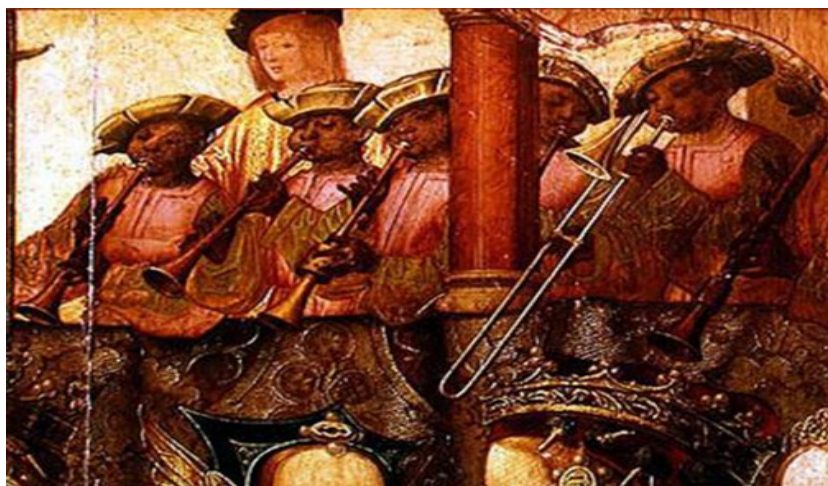
Figure 3: Detail of a shawm band and its master by Mestre do Retábulo de Santa Auta [Workshop of Lisbon led by Afonso Jorge], from The Encounter of Prince Conan and St Ursula (Casamento de Santa Úrsula com o Principe Conan) , c.1522/1525, Museu Nacional de Arte Antiga, 1462, Lisbon (from right hand side of the reader: a bombard, trombone, shawm, bombard, shawm, bombard, and on top between the two last musicians the master of the shawm band).

The depiction was formerly part of a triptych depicting different stages of St Ursula's life by the Mestre do Retábulo de Santa Auta from the Workshops of Lisbon led by Afonso Jorge 11 . Additionally, according to Lowe (2005), this specific panel ( The Encounter of Prince Conan and St Ursula ), may depict the wedding ceremonies of King João III to his first cousin, Princess Catherine of Castile (or Burgundy) in 1525 (Lowe, 2005, p.158). Positioned in the top right corner of this depiction is the earliest known representation of a renaissance wind band formed exclusively of black musicians (see Figure 3) 12 .