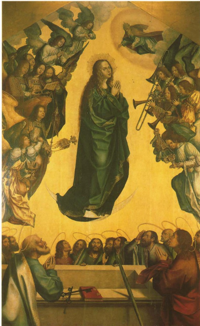
Figure 4: Oficina de Lisboa (attributed), Assumption of Setúbal ( Assunção de Setúbal ), c.1519/20–1530, Museu Municipal de Setúbal , Setúbal.

This depiction (Figure 4) was commissioned by Queen Dona Leonor and showcases the ascension into Heaven of the Virgin, surrounded by two groups of musical angels: on the left, four singing angels and on the right, a shawm band including a trombone and three shawms. The two groups of musicians appear to be playing together. Indeed, this correlates with contemporary accounts by royal chronicler