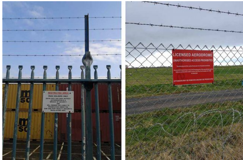
Fences mark the boundaries of prohibited areas on both walked routes.