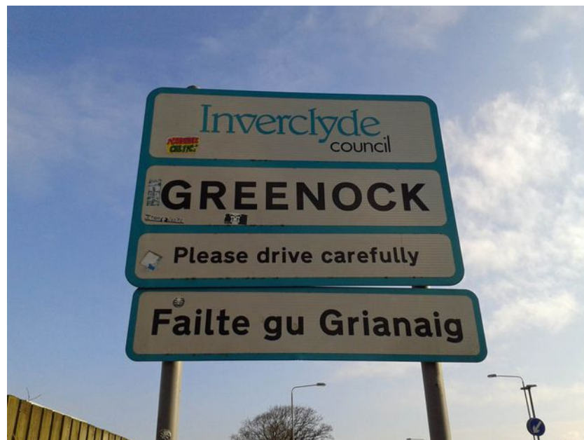
Road sign for Greenock on Laura's walked route.

Braidotti's focus on process and 'becoming nomad' is analogous to looking for a marker on a road or path: 'the nomadic subject is not a utopian concept, but more like a road sign' (2011, p.14). For much of Laura's early route, particularly in the Argyll and Inverclyde stages, the road signs are supplemented by another with the Gaelic version of the town name. Often there are four signs which read as a list: district, town, PLEASE DRIVE CAREFULLY, and the Gaelic version. She notices that a large number of the signs also have stickers on them, added by people. Signs are objects that invite us to look at them for information or guidance, but these have been augmented by the public, creating an alternative meaning to that which was intended. What the signs are signifying is also in a state of becoming, the meaning malleable and open to interpretation, obliteration, and subversion.