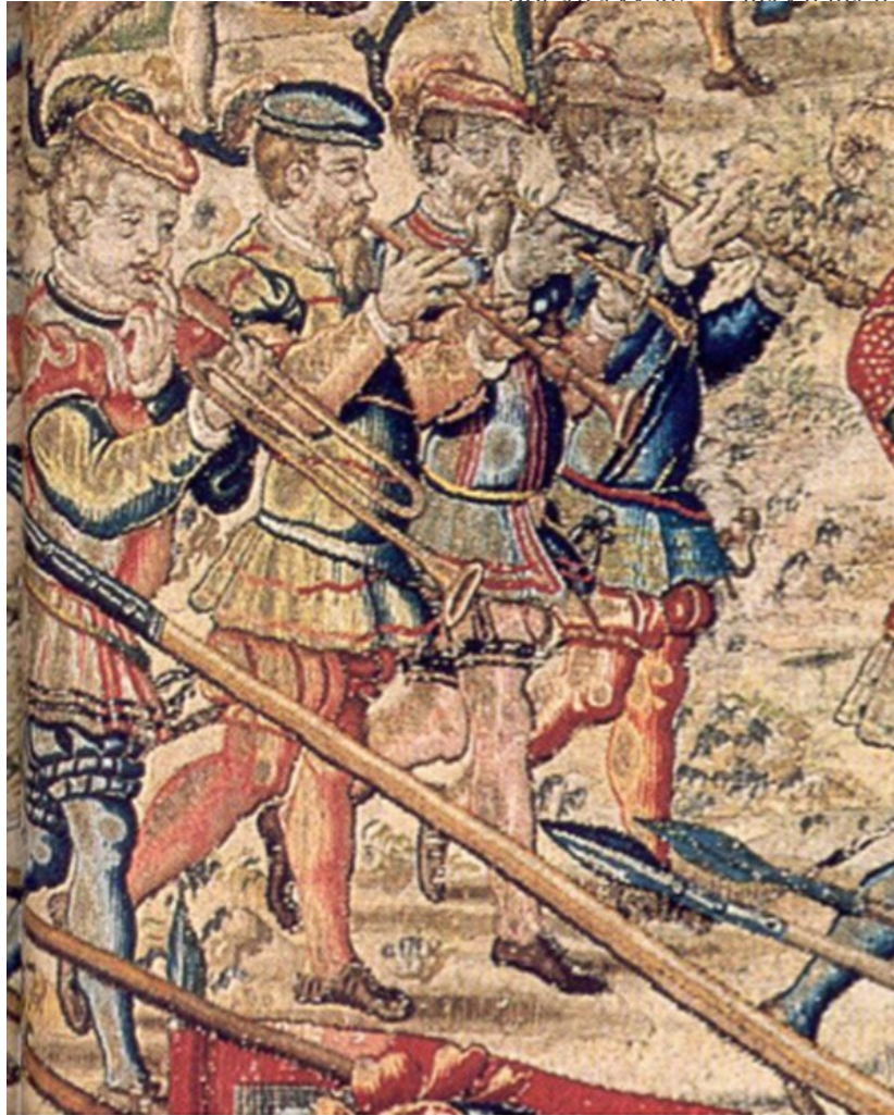
Figure 10: Detail of a shawm band with slide trumpet from Bartholomeus Adriaensz (tapestry) and Michel Coxcie (drawings), Entrance of Dom João de Castro in Goa (A entrada triunfal de D. João de Castro na Cidade de Goa em 22 de Abril de 1547), c.1555–1560, Kunsthistorisches Museum, TXXXII 10, Vienna.