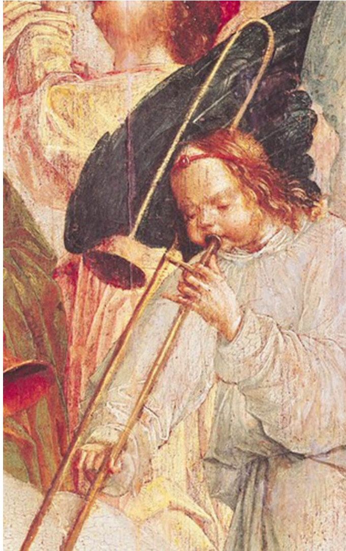
Figure 7a: Detail of trombone player from Friar Carlos Taborda Vlame.