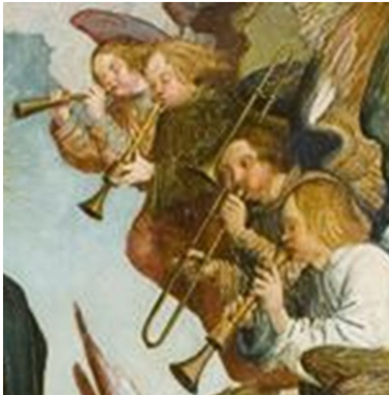
Figure 5a: Detail of a shawm band from Gregório Lopes (attributed).

trombone player's embouchure with puffed cheeks.