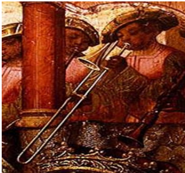
Figure 3a: Detail of the trombone player's handgrip from Mestre do Retábulo de Santa Auta (underhand movable slide and overhand around mouth pipe section) and trombone with two flat stays (inner and outer slide stays).

allowing good slide movement. The slide (depicted extended) appears to be in proportion with the rest of the instrument. Similar to the depiction by the artist Mestre of 1515 (see Figure 1, above) the trombone is rotated and the slide is in a horizontal position with identical handgrip to that used on the slide trumpet. Furthermore, the bell is located on the right-hand side of the player's head. Here too, the trombone player has inflated cheeks with centred embouchure.