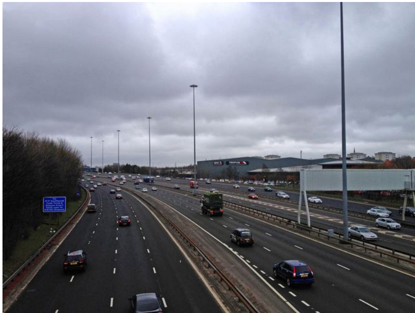
Crossing the M77.