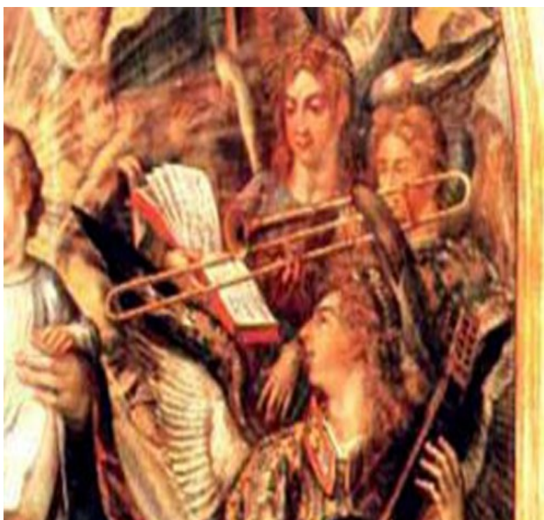
Figure 11a: Detail of trombone player on the right-hand side of the depiction from Vasco Pereira

The last Portuguese depiction of trombones in the shawm band studied here is a Coronation of the Virgin from the beginning of the seventeenth century (Figure 11). A group of musical angels surround the Virgin in the centre, including one trombone on each side. The player on the right, appearing to be reading from a score, holds the trombone in a manner close to modern technique (see Figure 11a, below). The player on the left holds the trombone with the right hand and the slide is operated by the left hand. The bell section on this trombone is also extremely elongated compared to the size of the instrument, meaning that the slide section appears foreshortened. These features seem unrealistic and may perhaps be attributed to artistic licence.