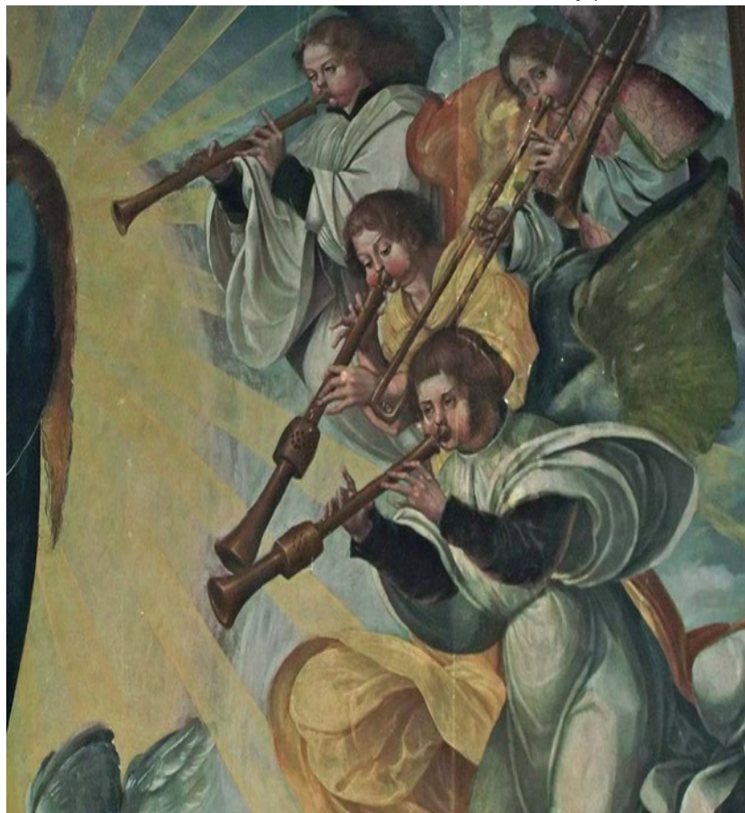
Figure 8: Detail of shawm band from Mestres de Ferreirim (Cristovão de Figueiredo, Gregório Lopes and Garcia Fernandes), Assumption of the Virgin (Assunção da Virgem), c.1520–1540, Igreja Matriz de Sardoura, Castelo de Paiva.

In this depiction (Figure 8) the Virgin is surrounded by musical angels: on the left-hand side by an organ player and singers, and on the right by a shawm band. The trombone depicted features details of ferrules on the bell, flat bell stay, and bell bow. The slide has inner and outer flat stays and there are also two rings: one on the bell and one on the slide bow. The trombone player holds the instrument with his left hand in an identical manner to the modern handgrip, close to the static inner slide stay. The slide is operated by the right hand, also in an identical handgrip to the modern trombone technique, with the hand holding the slide around the outer movable slide stay. The embouchure of the trombone player is again depicted with inflated cheeks.