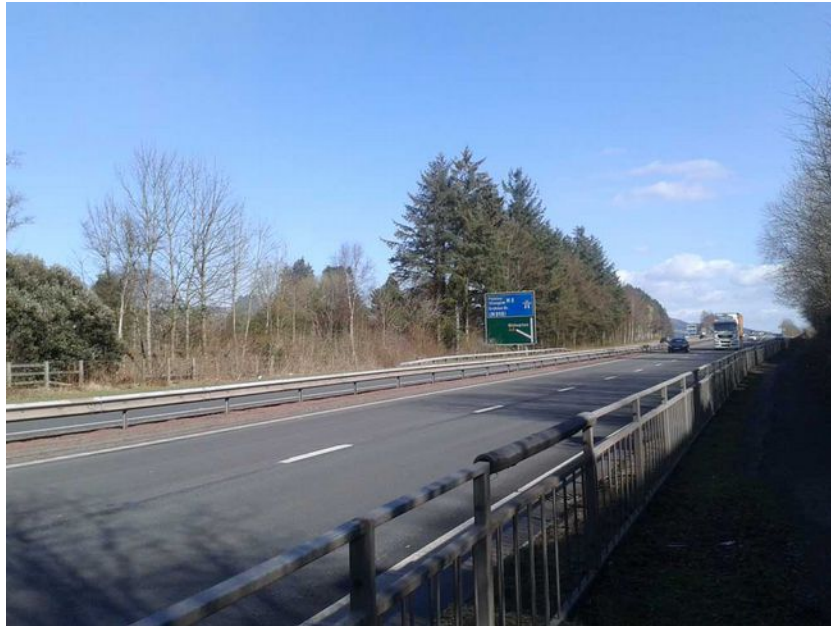
The road to Glasgow.