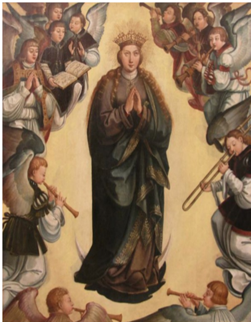
Figure 6: Cristovão de Utreque (attributed), Assumption of the Virgin (Assunção da Virgem), first quarter of the sixteenth century, Museu Municipal Leonel Trindade, 331, Torres Vedras.

The Virgin is surrounded by musical angels, four singers and a shawm player on the left-hand side, three shawms and a trombone on the right and two other shawm players in the two lower corners of the painting (Figure 6). The wind band appears to be playing alongside the four singers who are reading from a music manuscript. The trombone is depicted with two flat slide stays and a flat bell stay. The instrument is held with the left hand in an overhand manner away from the mouthpiece, below the inner slide fixed flat stay. The slide is operated with the right hand in an underhand grip while the arm is outstretched. However, similar to other contemporary depictions of the trombone, the slide is portrayed foreshortened. The bell of the trombone is