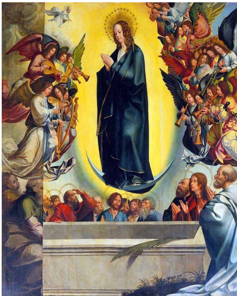
Figure 1: Mestre de 1515 , Assumption of the Virgin ( Assunção da Virgem do Retábulo da Madre de Deus ), 1515, Museu Nacional de Arte Antiga , 1278 Pint, Lisbon.

Commissioned by Queen Dona Leonor, widow of King João II, this depiction was part of the altarpiece of the Convento da Madre de Deus in Lisbon 5 . The Virgin is portrayed in the centre, surrounded by seventeen musical angels with instruments including a lute, harp, viola and a psaltery, with a three-hole flute depicted on the left. On the right hand side, there is a shawm band, a trumpet ensemble, and a group of singing angels (see Figure 1a, below). The three trumpeters depicted in the top right-hand corner above the singers are not playing, and hold their instruments close to the mouthpiece over their shoulders