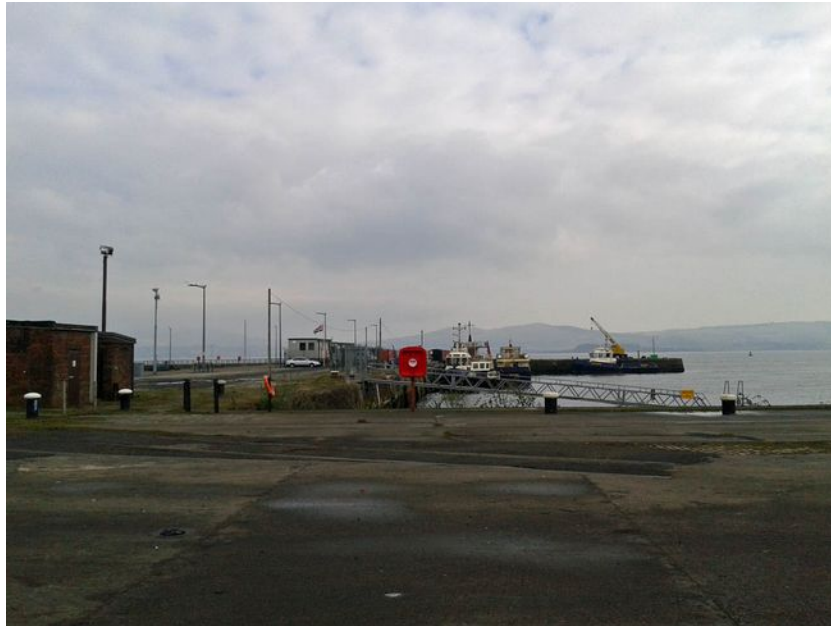
Clyde Estuary at Greenock.