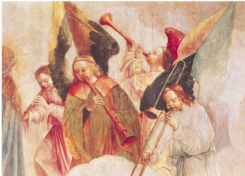
Figure 7: Detail of a shawm band by Friar Carlos Taborda Vlame (Frei Carlos), Assumption of the Virgin (Assunção da Virgem), c.1520–1530 18 , Museu Nacional de Arte Antiga, 82 Pint, Lisbon.