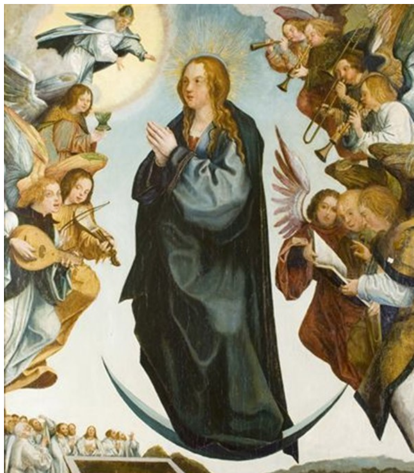
Figure 5: Gregório Lopes (attributed), Assumption of the Virgin (Assunção da Virgem), first quarter of the sixteenth century, Museu da Música, M.M. 1085, Lisbon 14 .

This depiction (Figure 5) follows the same Marian theme of the ascending Virgin surrounded by musical angels (as discussed above) with a similar group of depicted musical instruments: on the left-hand side, lute and rabeca, and on the right, shawms and a trombone, together with a trio of singers. The trombone's bell section, with flat stay and ferrules, is extended a considerable distance from the back of the player's head. The inner fixed slide stay is not visible and the trombone is held with the left hand close to the mouthpiece in an overhand manner. The player operates the slide with his right hand, using a similar handgrip to the standard modern trombone, thus suggesting movement. The slide, although depicted in an extended position, appears foreshortened. The position of the trombone on the right hand side of the player's head is consistent with the depictions described above, as it is the representation of