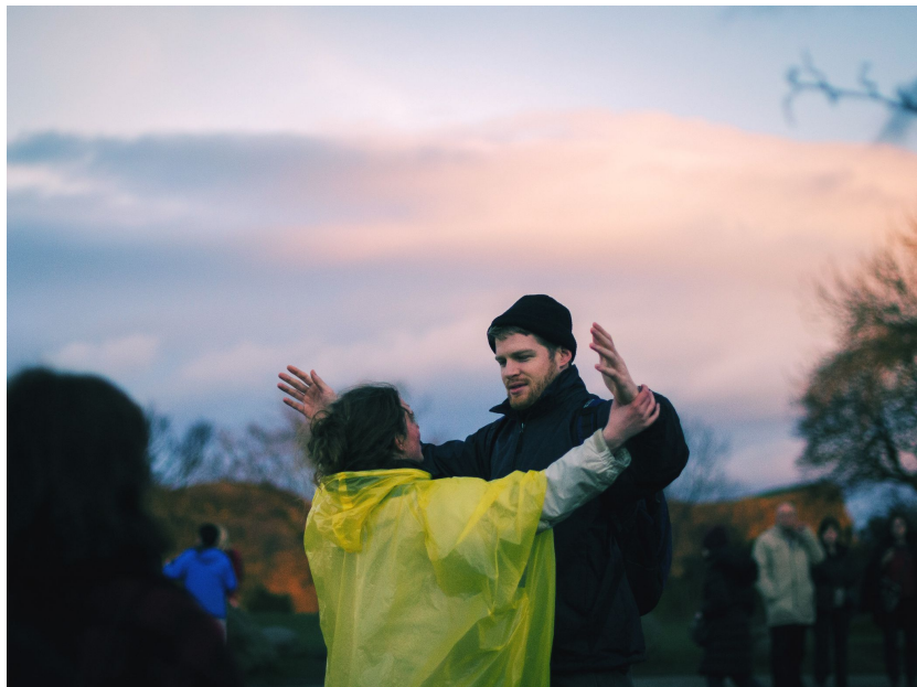
Calton Hill Constellations - site specific twilight performance

We fail to make enough space, failing better than if we had succeeded in making an invitation open enough to make dreaming comfortable. It is a place of failure, of inaccurate measurements, of interrupted attempts and incomplete projects. Of ill-fated, improvised technologies.