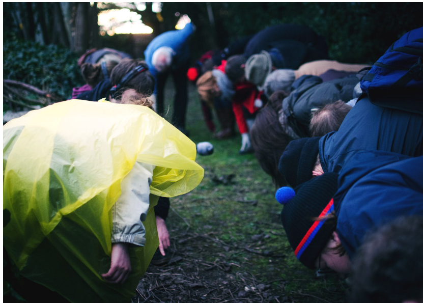
Calton Hill Constellations - site specific twilight performance

imagined restoring, by measuring pyramids.