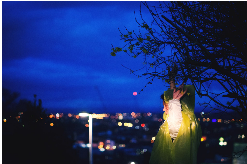
Calton Hill Constellations - site specific twilight performance

with this complex of complexity and recalcitrant stone, it became something more like a slithery and incriminating group work.