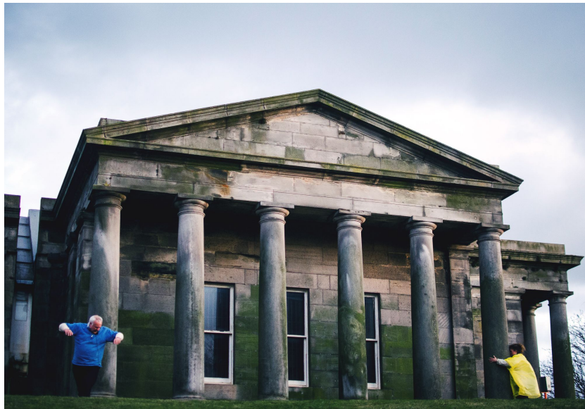
Calton Hill Constellations - site specific twilight performance