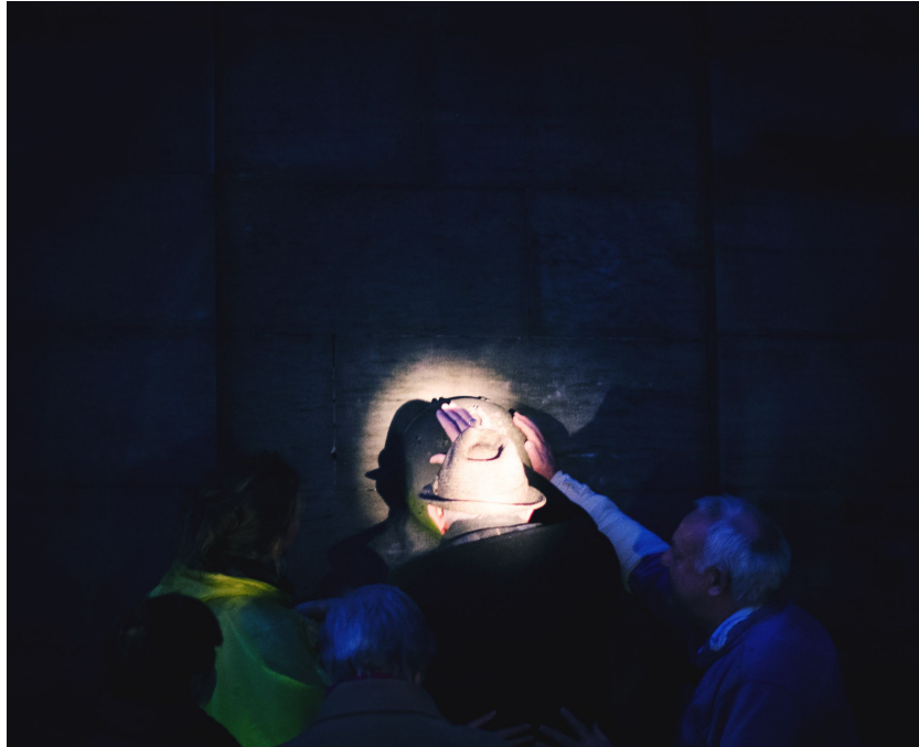
Calton Hill Constellations - site specific twilight performance

We chose a fire, heat, light, gathering. 'It burns, it gets more complicated'. Or rather, we sifted. For sure, temperature changes and shifts in the ground had been important here, measurements twisted by repetition, telling stories. Lights in the dark, seeing best in darkness, burning and radiating, gathered around an orrery that had lost its mechanical centre, its eye piece, its lenses, its metal casing. We 'stopped' our performance and swung it around this brick sun, because at our Wednesday preliminary sharing, when the temperature hovered around freezing, we wondered about having hot soup to warm the shivering audience.