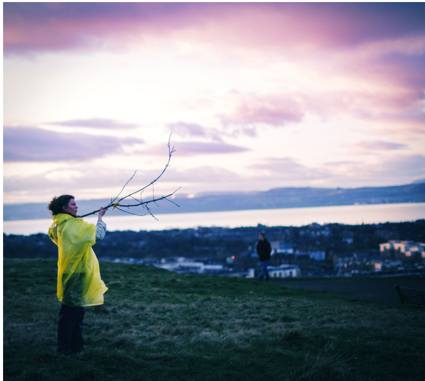
Calton Hill Constellations - site specific twilight performance

An automated voice with a Belfast accent informs us that we have crossed a line. We are not as we should be. The Observatory is a shocking ruin and should be left alone. A woman calls out to us over a wall: 'You shouldn't be in there'. 'It's alright, we're artists, it's probably just the rats'. Silence and a shift. No more questions. The authorities have not been informed. We are not where we should be. Our subversion suits this place. Some telescopes are still here. We are on a meridian line. We practice authentic movement, riff off the stuff and tap into some of that fairy boy sap that keeps spouting up. Did you notice the giant upturned telescope? Did you hear me slap the National Monument? One day we walked up a different way: not the civilised route but the way of strewn condoms and thorns.