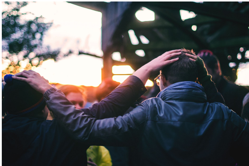
Calton Hill Constellations - site specific twilight performance

Siriol sculpted audience members into planets, using the traffic markings on the tarmac; making silently explicit that we all 'stand for' something else that is unstable, shifting in gravitational pulls, then jerking out of each narrative that we start.