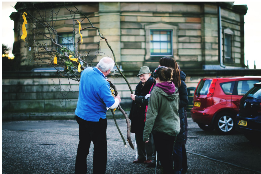
Calton Hill Constellations - site specific twilight performance

the audience had handled and carried was cooked. On Calton Hill, above the spot where the audience physically modelled orbits (re-working a moment from Béla Tarr's Werckmeister Harmonies ), rockets were fired into the night. There was something conservative about this coming back. The body of the route, segmented into its stopping points—our structure laid out in paper fragments on the floor of a flat in Easter Road—weighted by the baggage of tours that it traduces.